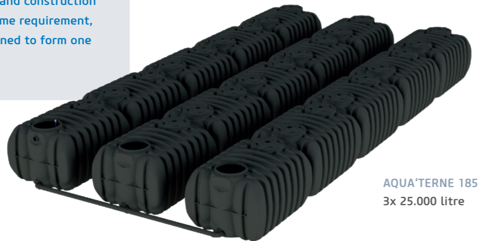
AQUA'TERNE 185 3x 25.000 litre

For more complex projects and construction projects with a higher volume requirement, several tanks can be combined to form one system.