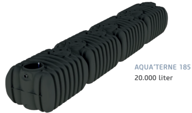
AQUA'TERNE 185 20.000 liter