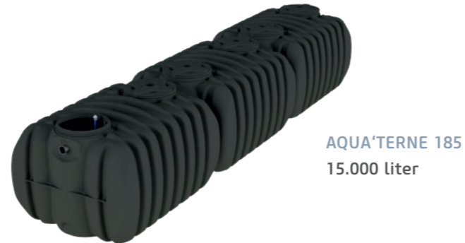
AQUA'TERNE 185 15.000 liter