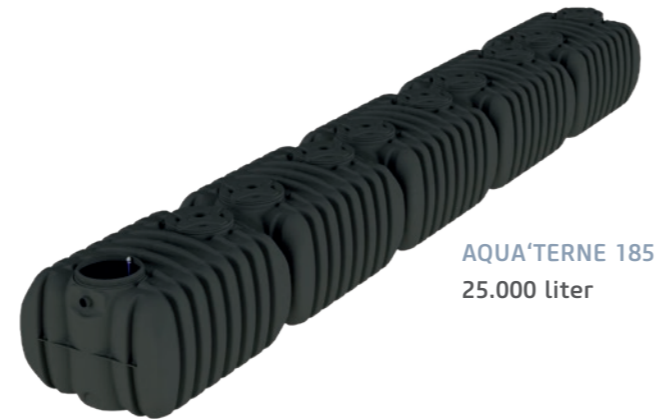
AQUA'TERNE 185 25.000 liter