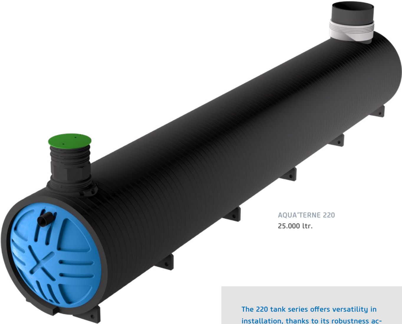
AQUA'TERNE 220 25.000 ltr.

The 220 tank series offers versatility in installation, thanks to its robustness accommodating load classes up to SLW 60