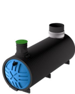
RIKUTEC 220 Series 10.000 ltr.